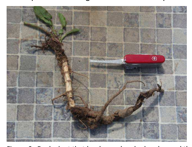
Figure 6. Dock plant that has been ploughed under, and then put up a shoot from the buried crown, that has then established a new crown and leaves. Note the elongated bamboo like appearance of the shoot that grew to the surface and that adventitious roots are only produced from the nodes.

Ploughing intact docks does not always guarantee success, because if the plants are large, they can send up shoots through a considerable depth of soil and reestablish themselves (Figure 6).