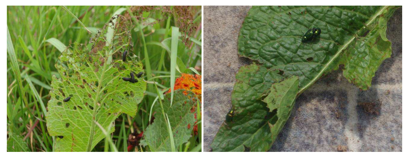
Figure 1. The green dock beetle (Gastrophysa viridula). Larvae skeletonising a leaf (left) adults (right)