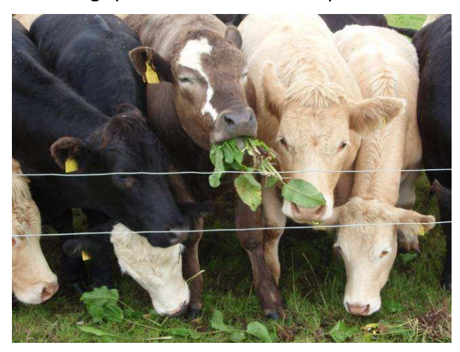
Figure 4. Beef finishers eating offered broad leaf docks plants while waiting to be moved to new pasture

Livestock species are well known for their varying acceptance of docks. Deer are the most tolerant, even liking docks, followed by goats and sheep which will eat younger foliage; being browsers, goats like the woody flower spikes. These are followed by cattle who will eat docks, especially if hungry (Figure 4), while horses avoid docks as much as possible. Where practical, cross grazing dock tolerating species with intolerant species can assist with keeping docks suppressed.