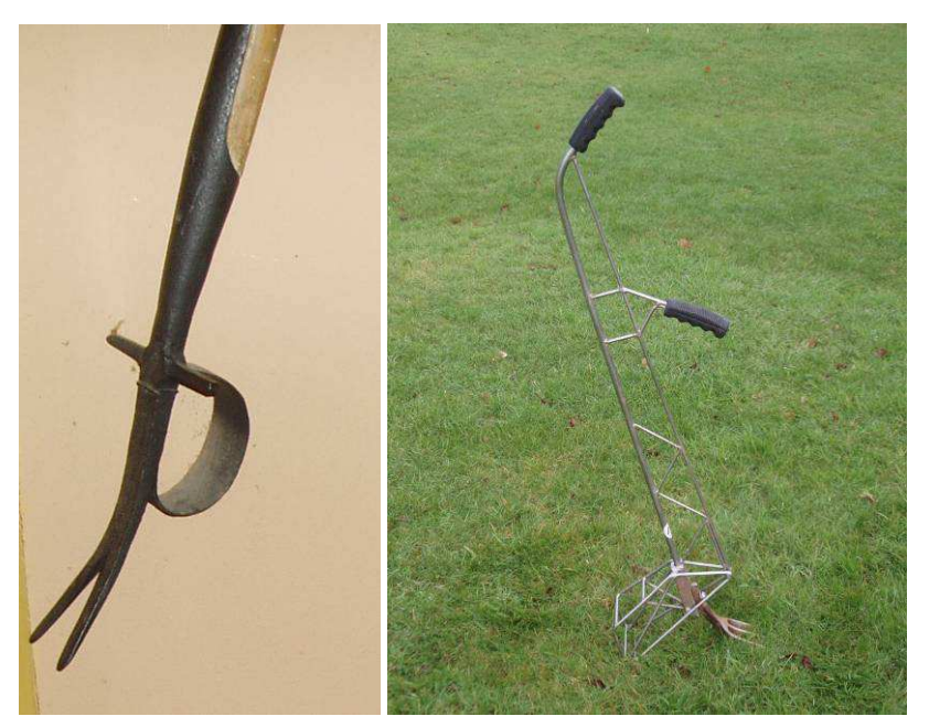
Figure 5. Traditional dock fork (left), modern ergonomic design with interchangeable heads (right) (LazyDogTools.co.uk)